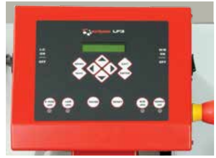
Control panel - easy to use