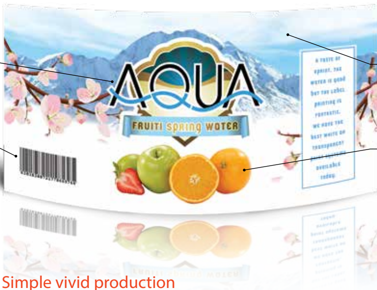
Simple vivid production