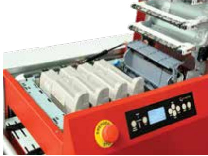
Quick toner cartridge change system