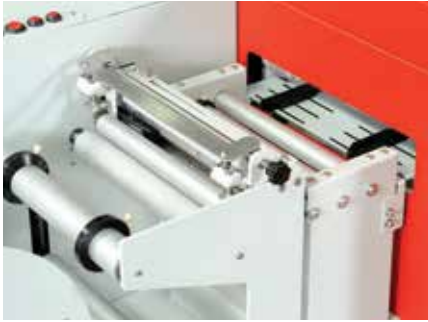
SecureTrack® - perfect media tracking